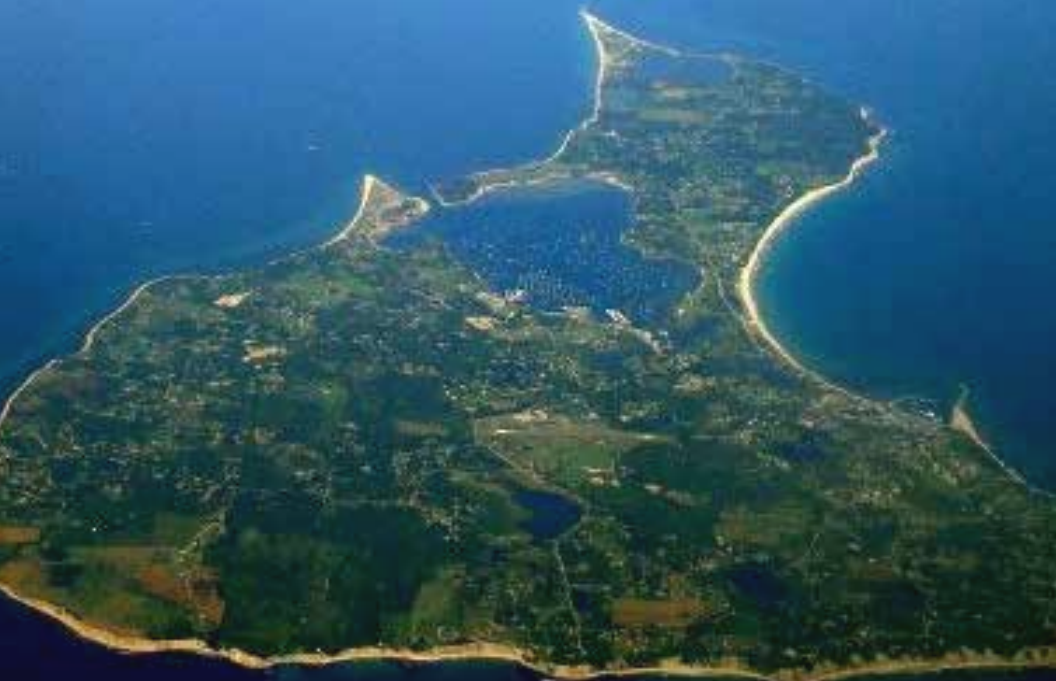
Aerial view of Block Island, RI

This fund will support the vision of following Christ everywhere. Locally, we will practice creation care using utility and energy practices that would promote earth stewardship of the building. In the greater world, we will support mission locally and abroad through our local witness and shared efforts with ABCUSA and ABCORI.